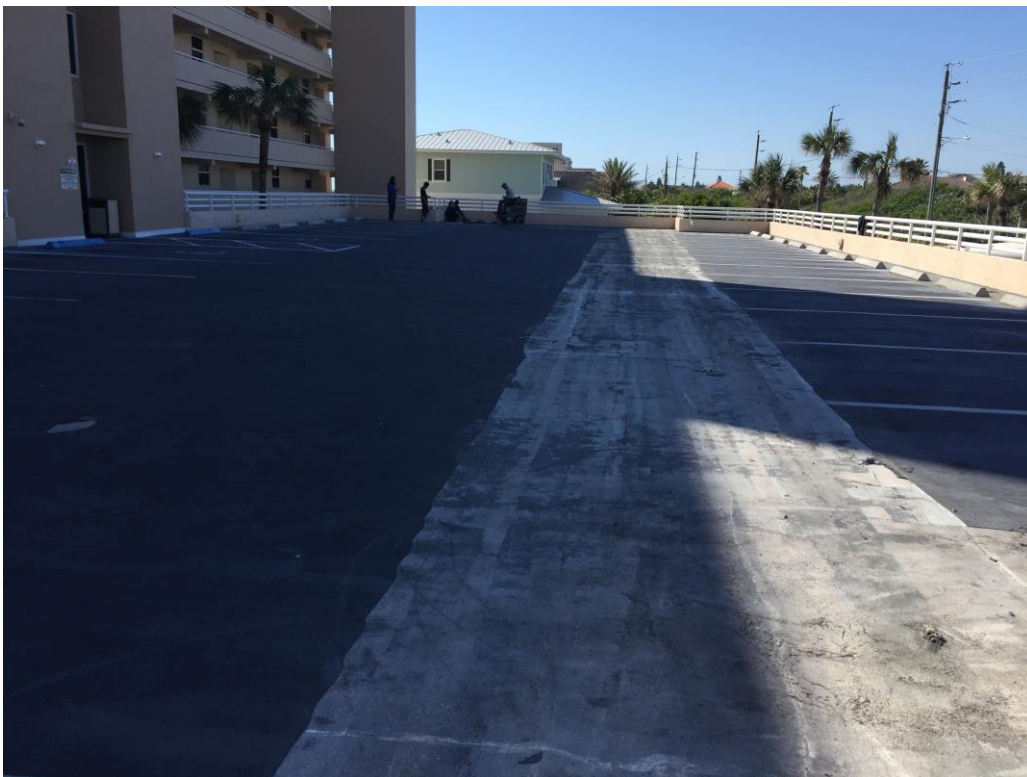
Picture 2: In-progress stripping of coating on topside of parking deck